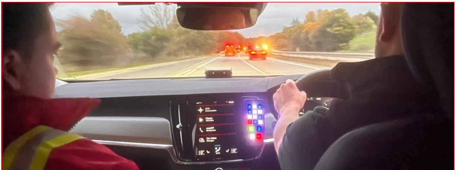
SARS volunteer responders Josh & Drew enroute to a serious road traffic collision in Suffolk 2022